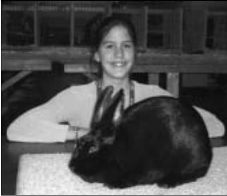
Best of Breed – Youth Best of Group Bailey Lick