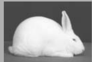
BOS, Jr Buck, 2003

2006 ARBA Fort Worth Convention 1st & 3rd Sr Buck, Best Sr; 3rd & 4th Sr Does; 2nd 6/8 Buck; 2nd 6/8 Doe; 2nd Jr Buck; 1st Fur, Best Display Best Commercial Fur