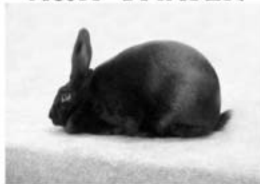
L J 378